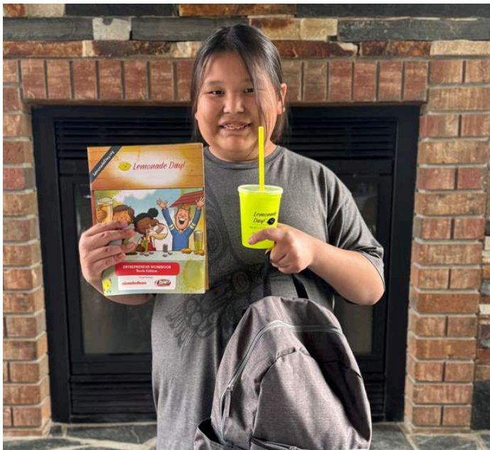
Student taking part in Lemonade Day training

Mark your calendars for June 15th and be sure to get out and support our local youth! Elementary students set up lemonade stands at various businesses in the Town of Peace River and the Town of Fairview. Lemonade Day teaches youth how to start, own, and operate their own business, fostering the next generation of business leaders, social advocates, community volunteers, and forward-thinking citizens. Community Futures Peace Country is grateful to be involved again, helping to empower our young entrepreneurs. We're also thankful to the local businesses hosting these young entrepreneurs and providing them with a platform to learn and grow. You can find all the Peace River and Fairview stands on an interpretive map at lemonadeday.org/northern-alberta . This provincial initiative, hosted by Community Futures Peace Country for the second year in a row, is sponsored by Northern Sunrise County, the Town of Fairview, and Lemon Social, which has generously provided all the cash prizes. This is a rain or shine event so be sure to come out and join us to support our local youth and celebrate their entrepreneurial spirit—one lemonade stand at a time!